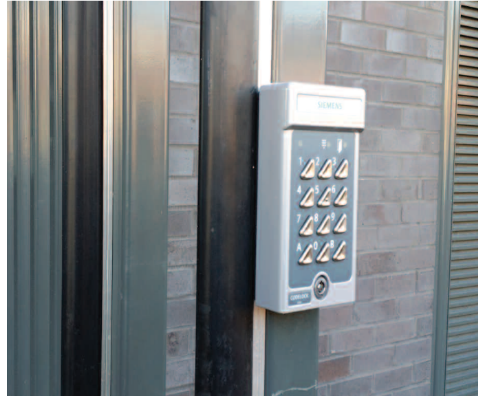
Secure gate access to protect car park and rear access to the building

Interphone is also providing a rolling, annual maintenance contract to ensure any potential faults that occur in the system are quickly rectified to avoid unnecessary disruption to the residents and added costs to the managing agent. It includes planned and reactive maintenance, taking advantage of the company's in-house engineering team, along with remote monitoring and diagnostics for the door entry system.