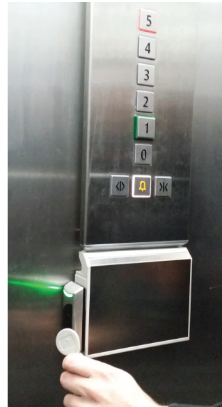
Innovative fob entry system