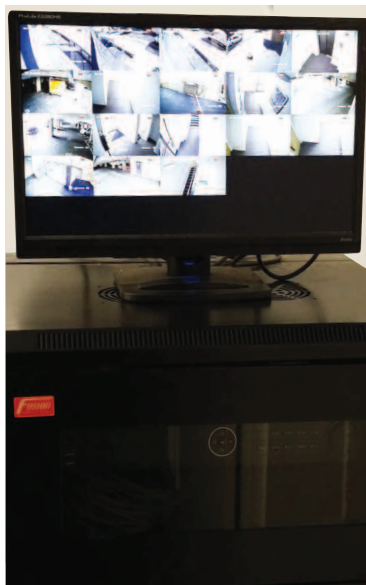
High security IP CCTV solution