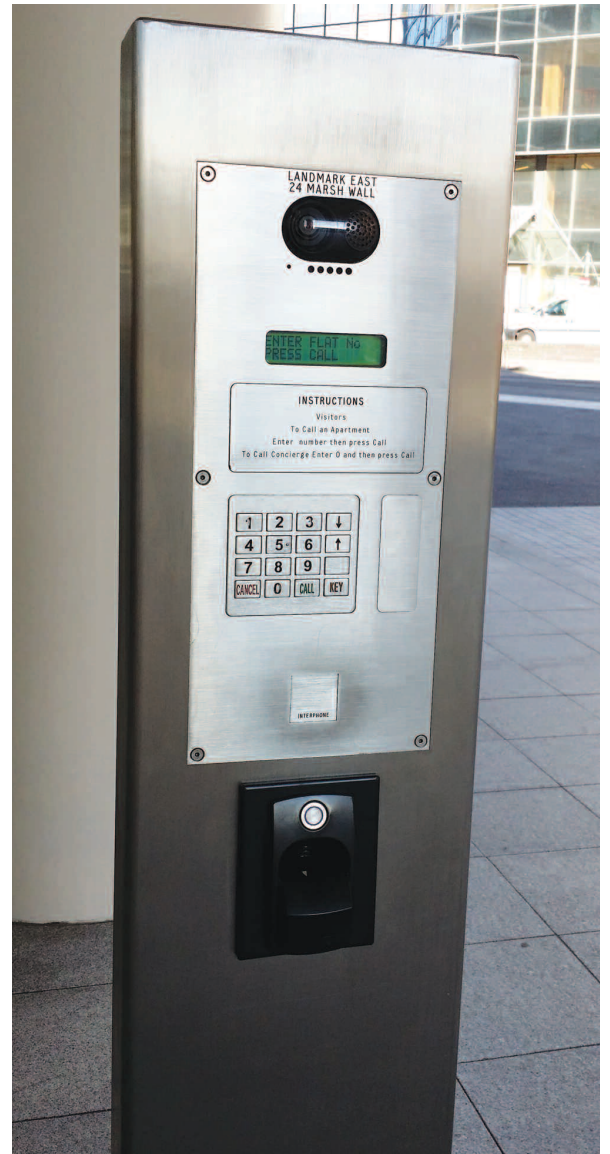
External and internal high-security biometric solution

"Interphone has been able to create and install an advanced biometric solution that is highly effective, cost efficient and meets our precise needs. We are now benefitting from fast, reliable and secure access both internally and externally, while protecting against the potential risk of card cloning."